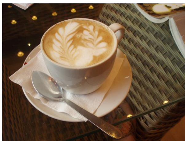
4 - Coffee morning

Please join us for our first SEN coffee morning which we will be holding on Thursday 25th January 9.00-10.00am.